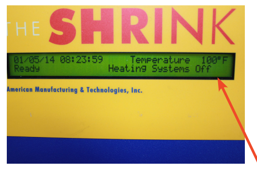
3. LCD READOUT SHOWING HEATING SYSTEMS OFF.