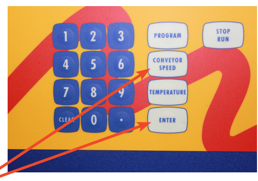
6. CONVEYOR SPEED: PRESS "CONVEYOR SPEED" BUTTON, KEY IN DESIRED SPEED, THEN PRESS "ENTER".