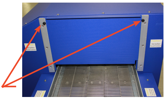
9. ADJUST ENTRANCE & EXIT DOORS (W/THUMBSCREWS) FOR DESIRED OPENING HEIGHT.