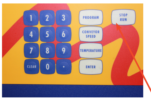
11. TO STOP CONVEYOR: PRESS "RUN/STOP" BUTTON AND CONVEYOR WILL STOP.