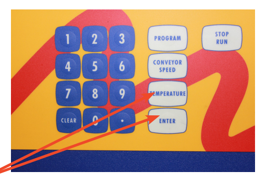
4. TEMP: PRESS "TEMP" BUTTON AND KEY IN DESIRED TEMP, THEN PRESS "ENTER" BUTTON.