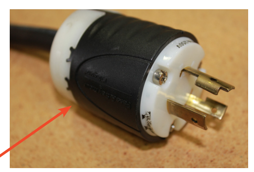
1. NEMA PLUG, STYLE L6-20, TURN-LOCK, 250-20AH.

*SAFETY: ALWAYS TURN OFF POWER BEFORE INVESTIGATING JAMS OR INTERNAL ISSUES. NEVER PLACE FINGERS, HANDS, OR TOOLS INTO THE MACHINE WHILE IT IS PLUGGED IN.