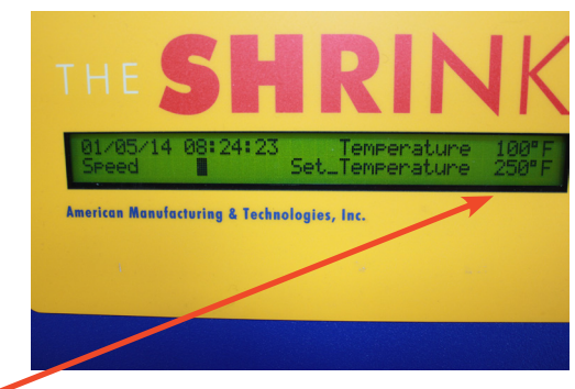
-5. TEMP IS SET @ 250 DEG. F. WILL TAKE TIME TO RAMP UP TO TEMP.